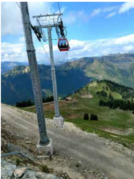
Crystal Mountain Alpine Ski Area