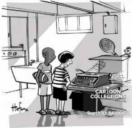
"It appears to be some sort of ancient texting device."