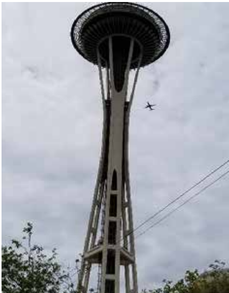
Seattle Space Needle