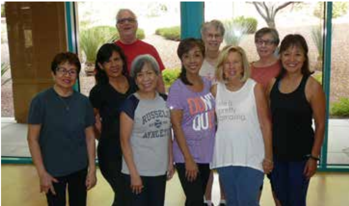
Solera Starz Cardio Class