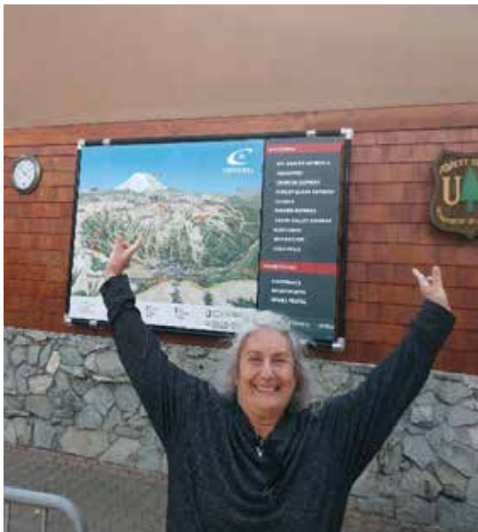
Crystal Mountain Lodge