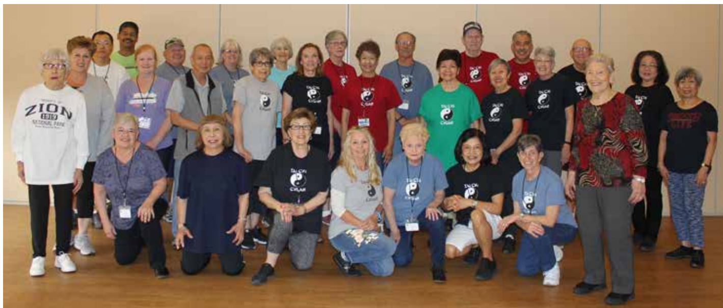
Tai Chi Class