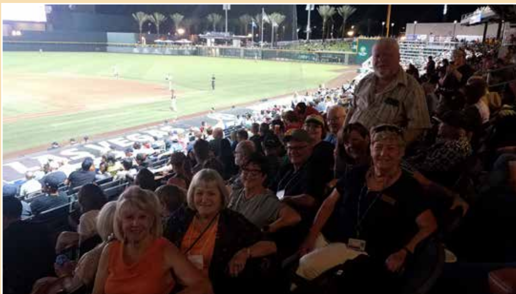
AVIATORS BASEBALL GAME